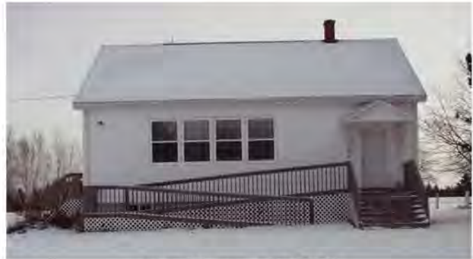
New Community Hall