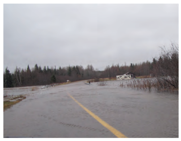
Tory Road December Storm Surge