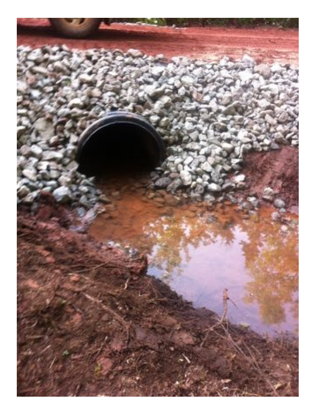
New 3ft Culvert installed.