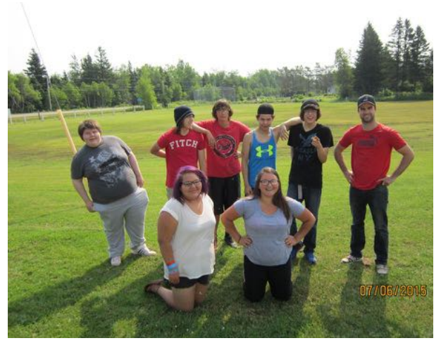
Lennox Island Youth assisting our watershed in tree planting.