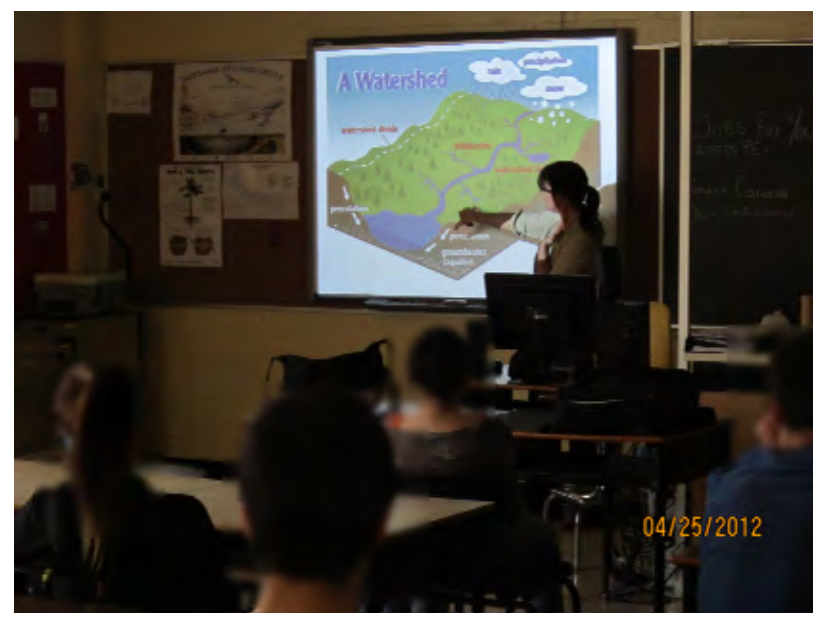
Seminar at West Isle School

We also worked closely with the Municipality of Lot 11 and Area in the Warburton Park summer recreation program. Watershed-relevant activities, like the Invasive Species Easter Egg Hunt, brought watershed awareness and values to pre-school children.