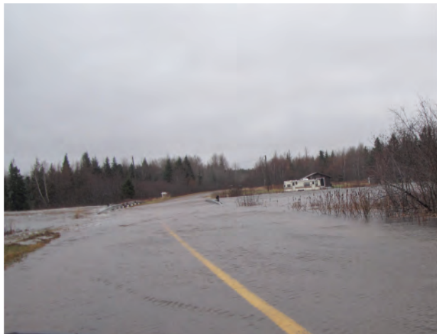
Tory Road December Storm Surge